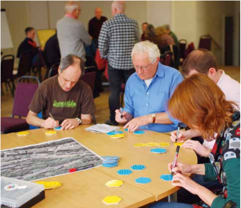
Our consultation day in Hebden Bridge in February 2016

The CLT will be looking to make the bungalows models of sustainable, environmentally-friendly construction. The 'HAPPI' (Housing our Ageing Population: Panel for Innovation) standard will be met.