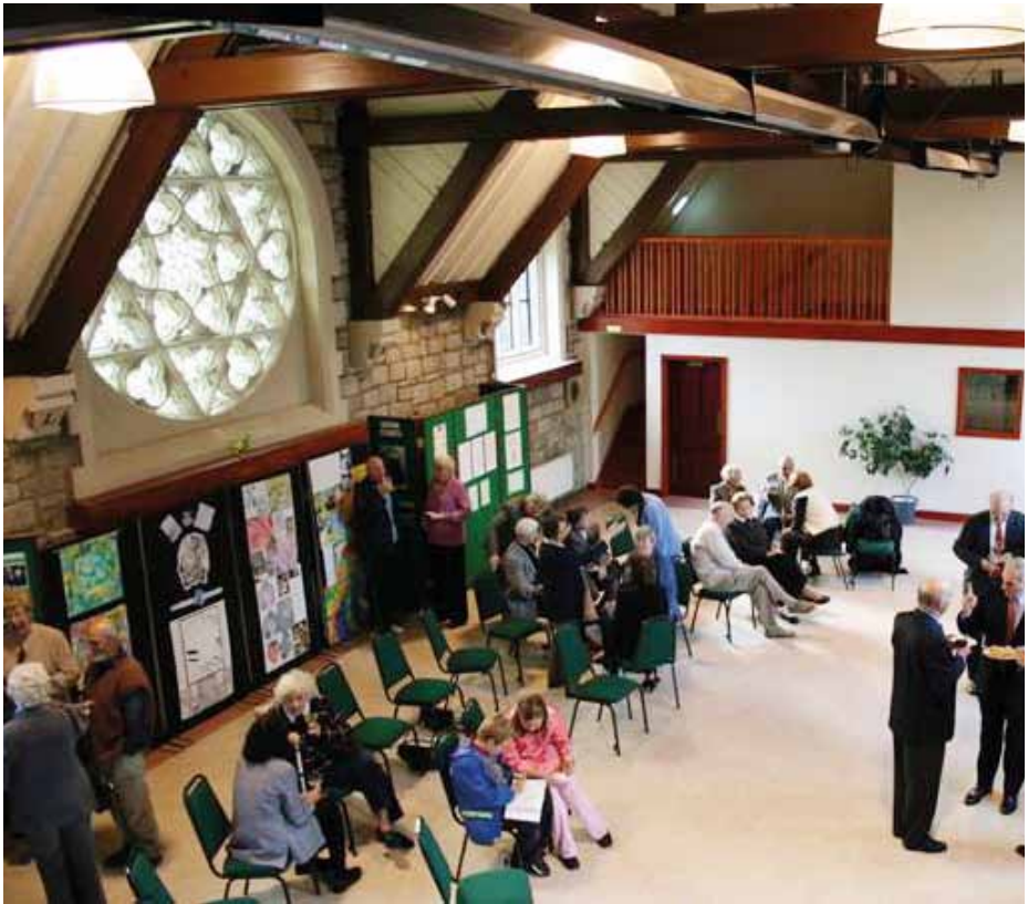
The Fielden Centre is a much-loved community resource.

The CLT holds ownership of the centre and works very closely with the Fielden Centre Association charity, which continues to manage and operate the building.